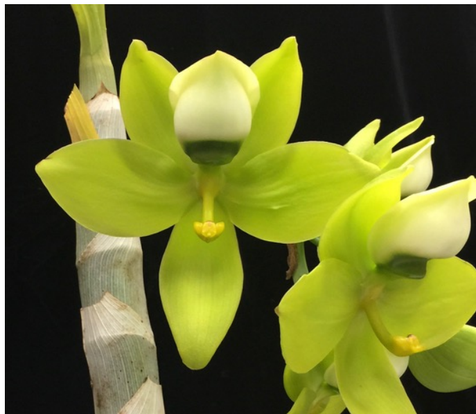
Cyc. warszewiczii 'SVO Jumbo' AM/AOS