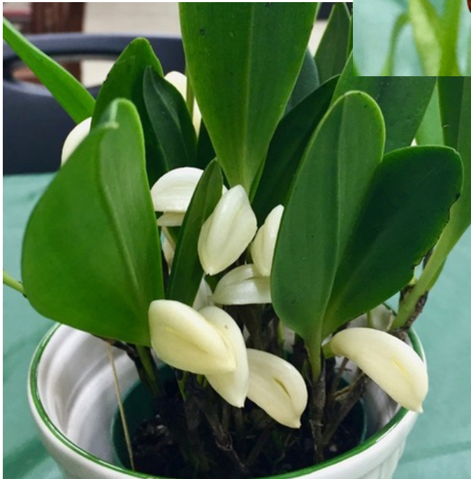
Zootrophion vulturiceps 'Windflower' HCC/AOS