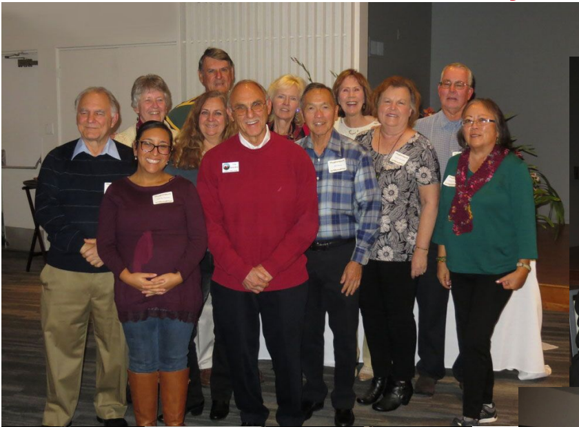
POS 2019 Board of Directors (left)