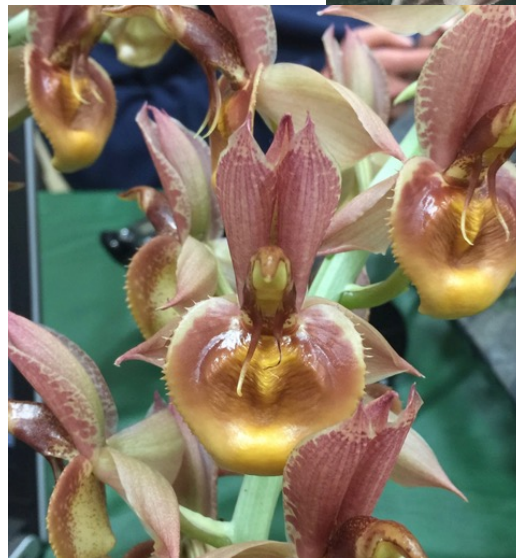
Ctsm. spitzii 'Apricot' CHM/AOS